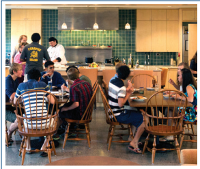
Students live and learn sustainably at the Kohler Environmental Center.

Your generosity is the key ingredient that helps provide Choate students with life-changing experiences.