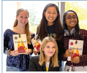
Author Tara Westover visits campus.