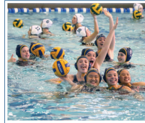
Students practice teamwork, perseverance, and sportsmanship in the Larry Hart Pool.