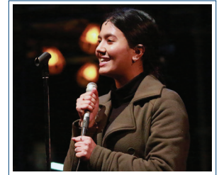
Young artists express their creativity on stage in the Paul Mellon Arts Center.